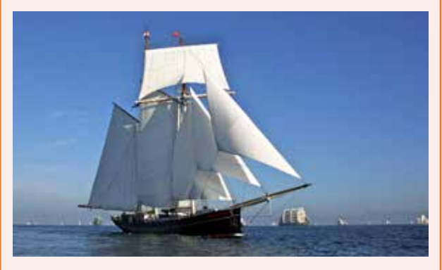
Departs 11 July 2025 for 4 days, Just £299 including breakfast, accommodation and transfers.

Experience the excitement of Tall Ships, combined with free time in Lille, staying at the excellent Novotel Lille Centre Gare.