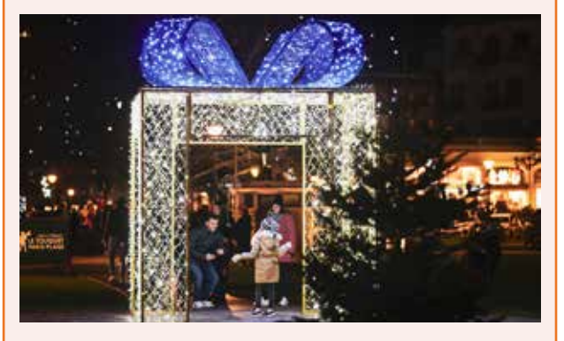
Priced at just £219, departures are on the 5th and 12th of December for 3 days on a bed & breakfast basis, staying at the B&B Hotel Boulogne Centre les Ports.

Join us on these two festive weekends to explore Boulogne and Le Touquet Christmas Markets.